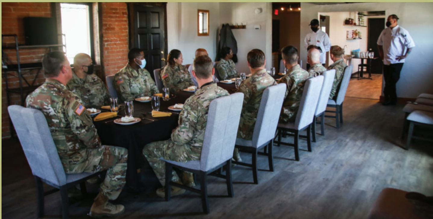
10th SFG (A)’s culinary specialist serves his capstone three-course meal as part of the Bridge to Gap program. The program is designed to bring Soldiers out of the Army’s dining facilities and give them a holistic perspective of the food industry outside of the military.