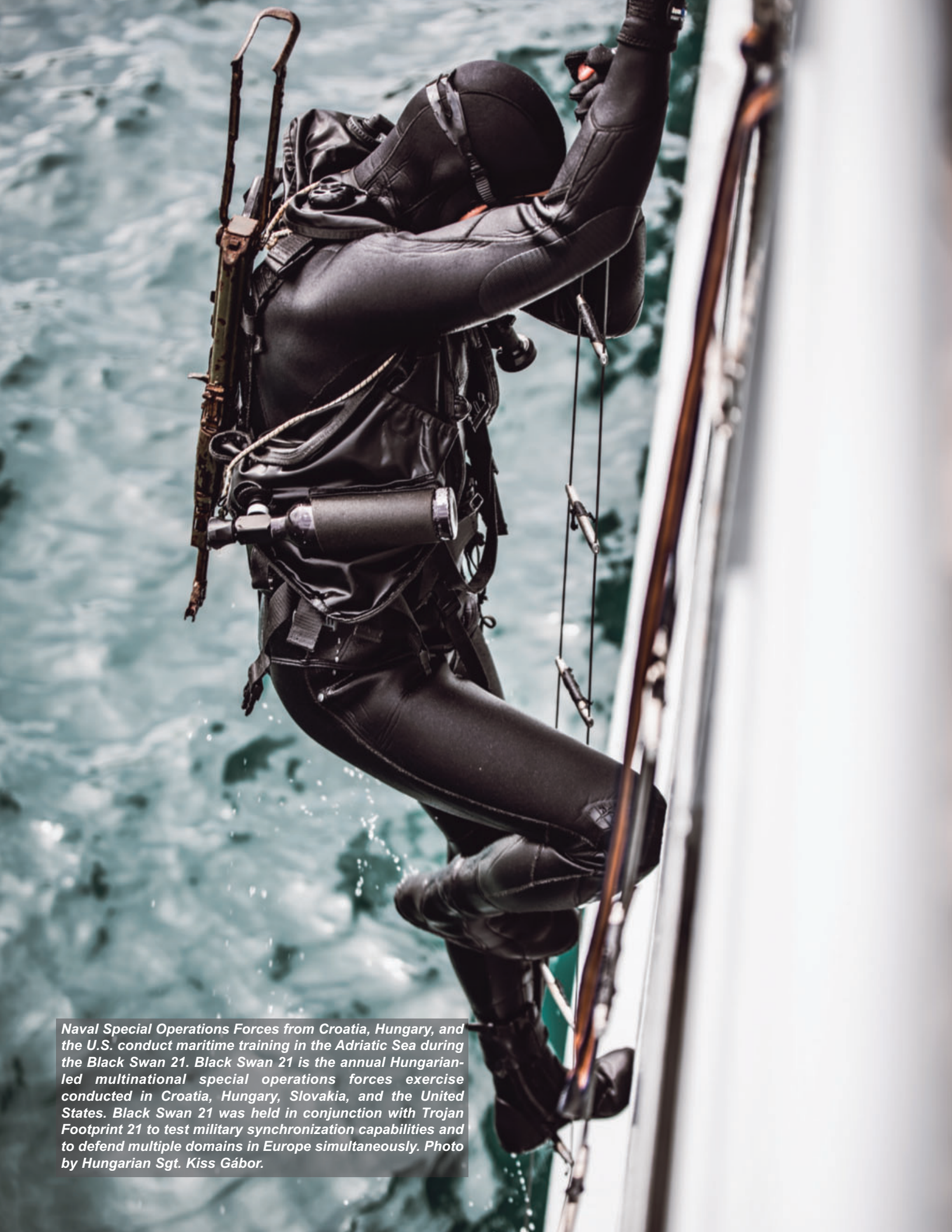
Naval Special Operations Forces from Croatia, Hungary, and the U.S. conduct maritime training in the Adriatic Sea during the Black Swan 21. Black Swan 21 is the annual Hungarian-led multinational special operations forces exercise conducted in Croatia, Hungary, Slovakia, and the United States. Black Swan 21 was held in conjunction with Trojan Footprint 21 to test military synchronization capabilities and to defend multiple domains in Europe simultaneously.