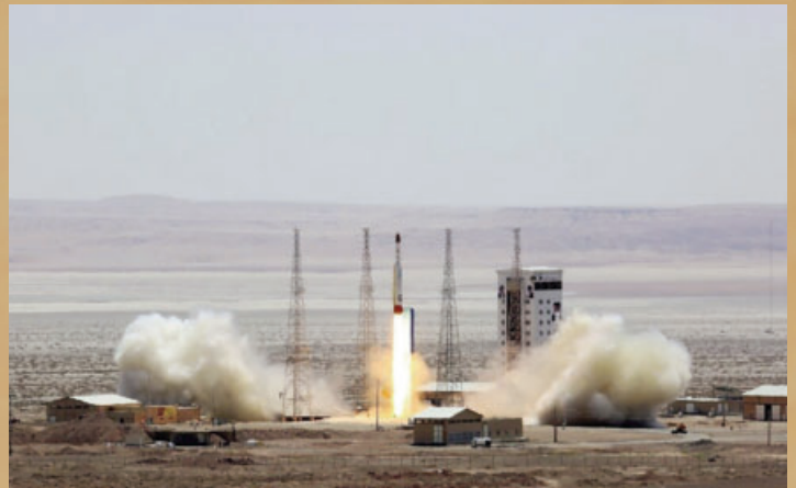
Imam Khomeini Space Center in Iran.

The CWMD Fusion Cell transitioned into a USSOCOM Directorate, the J10, in 2020. This transition increases and improves integration within the Headquarters and SOF enterprise, among the theater special operations commands and the service SOF components. The SOCOM J10 enables the joint force to execute a campaign that ensures the U.S. and its interests worldwide are not attacked or coerced by the use of weapons of mass destruction. About one-third of the Directorate work out of USSOCOM headquarters in Tampa and further the planning and intelligence responsibilities within the SOF enterprise.