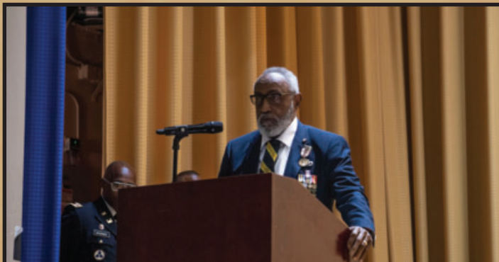
SOCOM patriarch retires after a remarkable 63 years of service ... 28