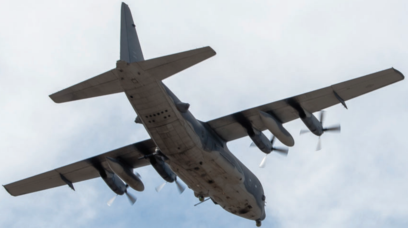
An AC-130W aircraft, piloted by members of the 551st Special Operations Squadron, flies over Cannon Air Force Base, N.M., April 29, 2021. The flight was flown to commemorate the last training flight of the 551st SOS.