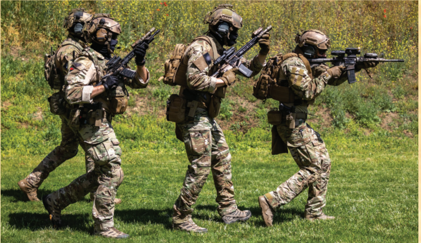
Special Operations Forces from Austria, Croatia, Hungary, Slovakia, Slovenia, and the United States conduct multinational weapons familiarization range training as part of Black Swan 21 in Szolnok, Hungary, May 12, 2021. Black Swan 21 is an annual Hungarian-led multinational special operations forces exercise, demonstrating peer-to-peer deterrence and the resiliency of alliances and partnerships in Europe.

Tabor, the commanding general of U.S. Special Operations Command Europe.