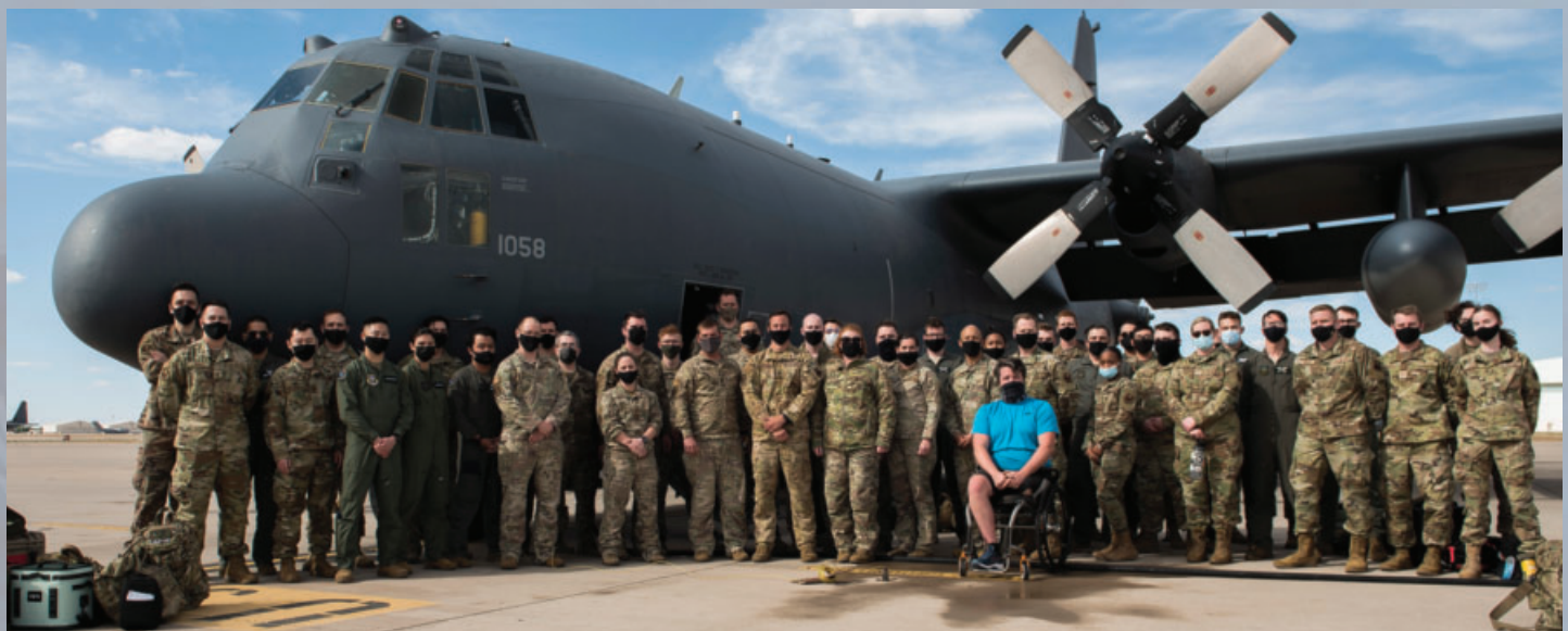
Members of the 551st Special Operations Squadron stand together for a group photo after the unit’s “fini” flight at Cannon Air Force Base, N.M., April 29, 2021. Fini flights are an Air Force tradition when a pilot or unit conducts its last flight. The 551st SOS stood down June 15, 2021.