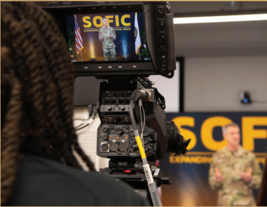
Army General Richard D. Clarke, commander U.S. Special Operations Command, addresses the annual Special Operations Forces Industry Conference held virtually from SOFWERX in Ybor City, Fla., May 17-21, 2021. SOFIC is the premiere virtual conference for the SOF community to interact with industry and to collaborate on the challenges, initiatives and way-ahead in delivering the most cutting-edge capabilities into the hands of SOF operators.

Army Gen. Richard D. Clarke, commander, USSOCOM. “Investing in both people and key technologies is going to be essential. Together, our military and industry will answer the call to innovate for the nation for the next 20 years and beyond.”