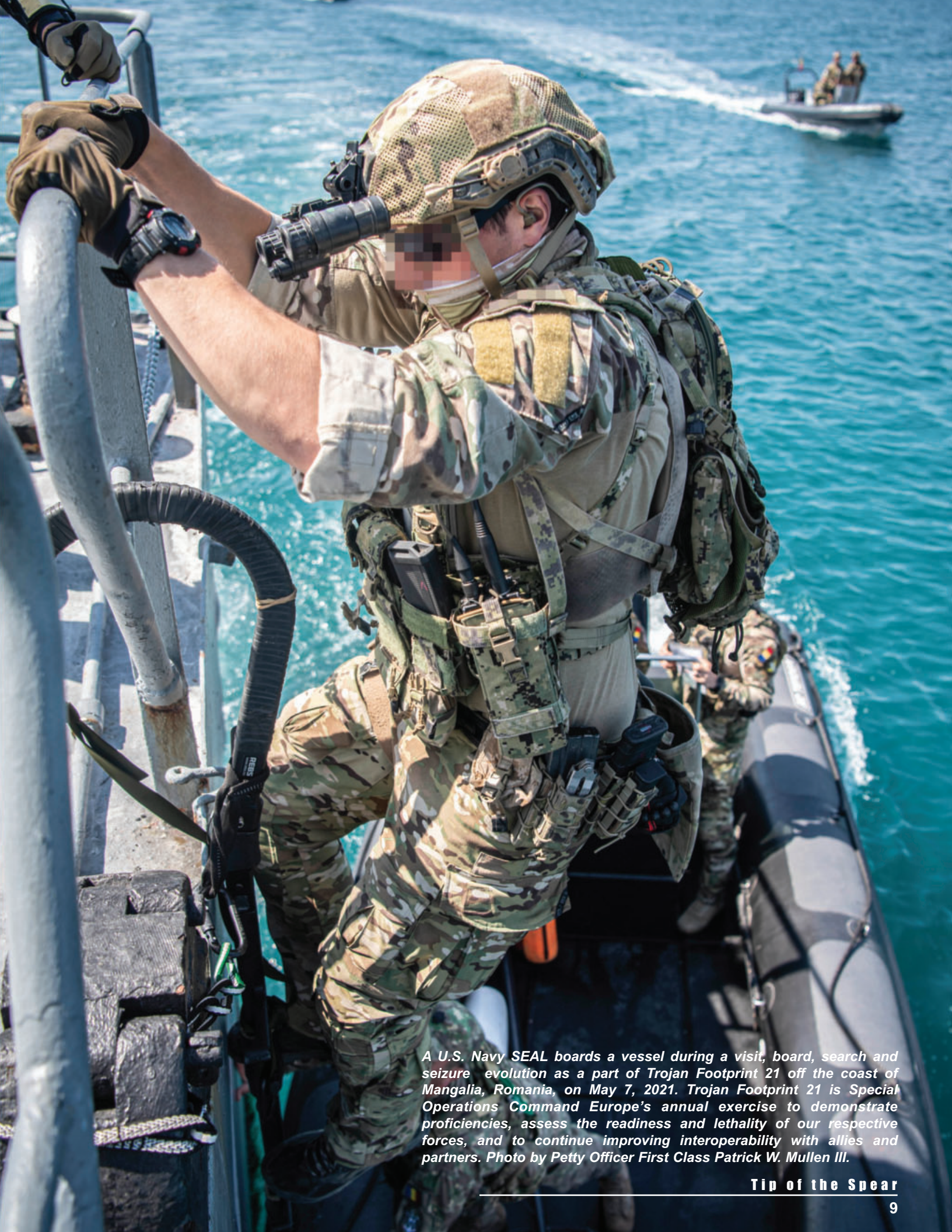
A U.S. Navy SEAL boards a vessel during a visit, board, search and seizure evolution as a part of Trojan Footprint 21 off the coast of Mangalia, Romania, on May 7, 2021. Trojan Footprint 21 is Special Operations Command Europe's annual exercise to demonstrate proficiencies, assess the readiness and lethality of our respective forces, and to continue improving interoperability with allies and partners.