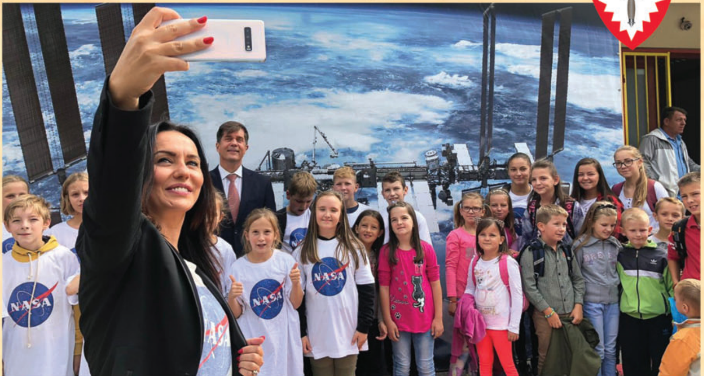
A U.S. Civil Affairs team assigned to Special Operations Command Europe and mobilized in Bosnia and Herzegovina (BiH) helped connect Jezero, BiH to NASA's Perseverance Rover mission on Mars.