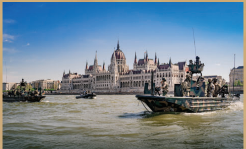
Hungarian special operations forces train in riverine boats on the Adriatic Sea during Black Swan-21, a Hungarian-led multinational special operations forces exercise. The Hungarian-led multinational special operations forces exercises conducted with Austria, Croatia, Hungary, Slovakia, and the U.S. in May of 2021 to test military synchronization capabilities and to defend multiple domains in Europe simultaneously.