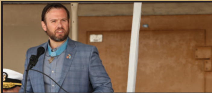
Two Medals of Honor, four generations of Navy SEALs at Class 342 graduation ... 18