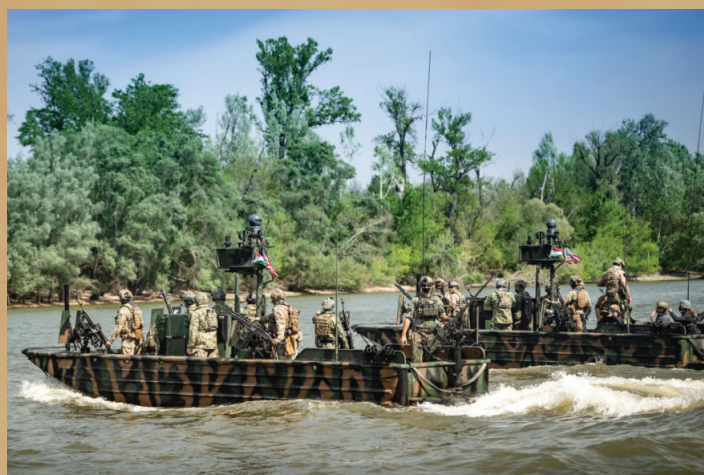
Hungarian special operations forces train in riverine boats on the Adriatic Sea during Black Swan-21, a Hungarian-led multinational special operations forces exercise.