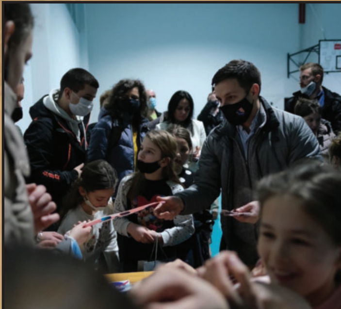
SOF Civil Affairs: Bringing worlds together ... 6